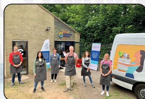
From left to right: Emmanuel Baptist Church in Liverpool Moortown Baptist Church.

From left to right: Image from the Young Adults Report, 2022 Baptists Together Annual Review p41 Image from the Baptists During the Pandemic Report, 2022 Baptists Together Annual Review p14 Image by user6164906, freepik.com