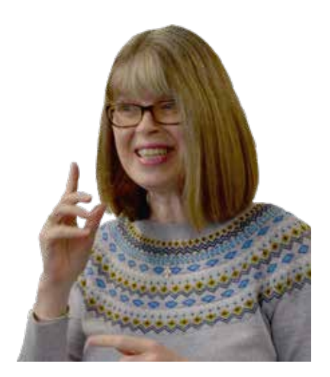
Lynn Green is the General Secretary of the Baptist Union