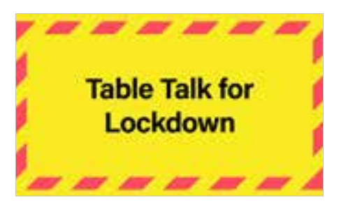
Table Talk for Lockdown

Our Joint Public Issues Team has launched Stay and Pray - pointing people towards different issues - local, national and global - that they want to encourage us to pray for. This will particularly highlight vulnerable and marginalised groups during the Coronavirus crisis. Click here to find out more and sign up for the daily email.