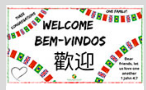
Three congregations, one family - gathering for worship at Warley Baptist