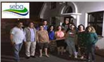
Arabic Community Church - mission in Brighton, Worthing and Egypt