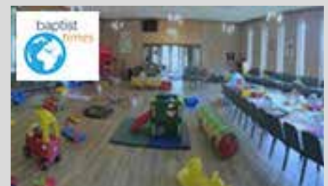
Why toddler groups are vital to the life and growth of the Kingdom of God