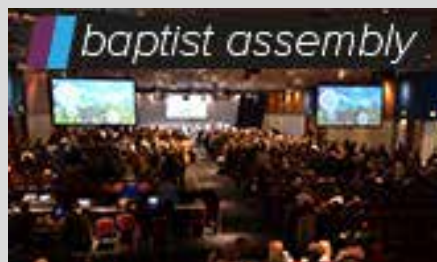
Reports, photos and resources from our Assembly in Telford