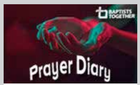
available to download Please print out a copy for those unable to access it