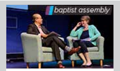
Read about our Baptist Assembly in Peterborough last month and share stories and resources with your church